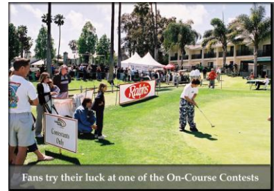
Fans try their luck at one of the On-Course Contests

Fans of the 2011 Cox Celebrity Championship hosted by Drew Brees will be given the opportunity to win a car. On Saturday, May 21 and Sunday, May 22, the tournament will hold a putt for a car contest. The qualifying putt of the contest will take place on the Morgan Run practice green adjacent to the 18 th green. For only a $2 donation, fans will get to putt for a shot at a 2011 car. Contestants who sink their putt will be entered into a drawing for a chance to putt for a 2011 car on Sunday, May 22 at the 18 th green.